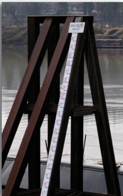
Custom Stevens staff gage mounted on a sloped pier on the Willamette River in Portland, Oregon. The submarine pictured is the USS Blueback .