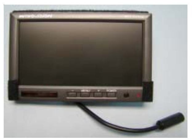
The Microvision 7 inch LCD Color monitor

One may use any TV monitor (NTSC) that accepts an analog signal to view and any VCR to record from the GeoVISION™ video and audio outputs. Sunshades are standard on all GeoVISION™ monitors. There are several types of video to USB adapters available from electronic retailers, They are not stocked by MPI. These devices allow one to view with and record directly to a computer.