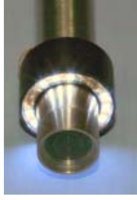
The 9 LED ring light is one of several options for the micro camera.