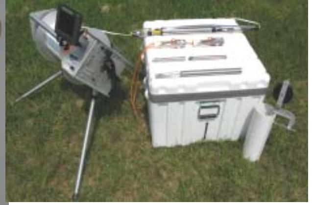
The deluxe winch, the micro camera, the nano camera with motorized side looking mirror, the standard camera, the Jr camera, the motorized pan and tilt with a standard camera. They are resting on top of the deluxe carrying case which is 26 x 26 x 22 inches and foam lined. The encoder wheel and cable protector is to the side of the case.

The motorized Pan and Tilt is shown left and above. The motorized pan and tilt option is used with the Jr and Standard cameras to view in any direction using a joy stick. Adjustable stainless steel centralizers as shown are standard. A closeup of the nano camera with the motorized side looking mirror is shown with a dime for scale.