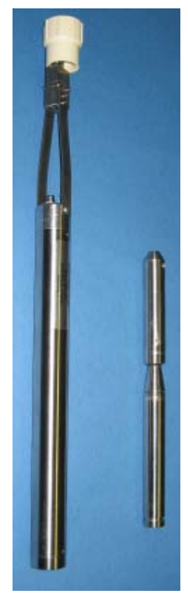
micro and nano cameras